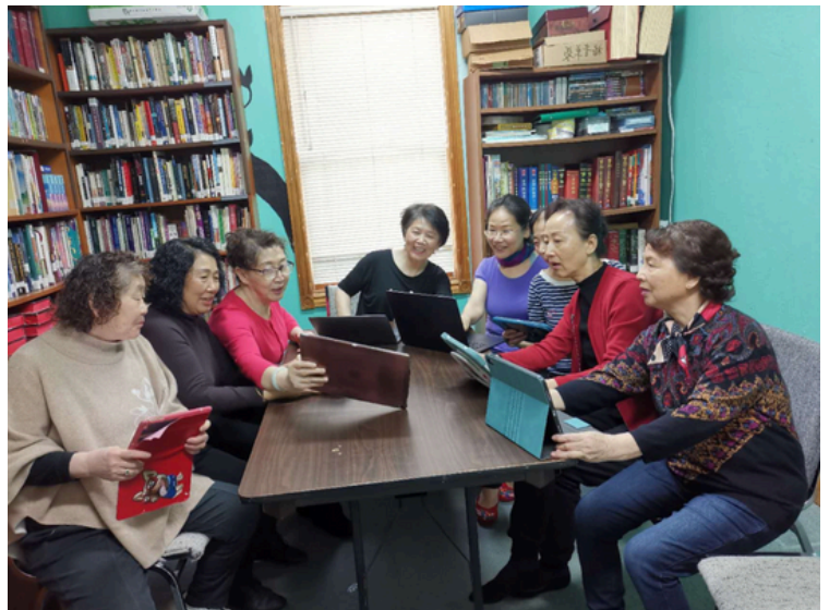
Top: Durham Foreveryoung Activity Centre, adopting new technology/approaches for improving the services for seniors.